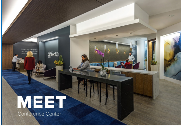
MEET Conference Center