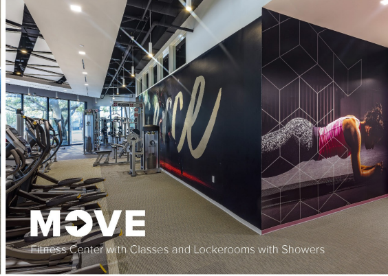
MOVE Fitness Center with Classes and Lockerrooms with Showers