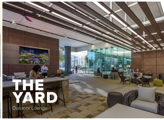
THE YARD Outdoor Lounge

ONE & TWO ELDRIDGE 757 & 777 N Eldridge Parkway Houston, TX 77079 RENTAL RATE $30.00 NNN w/2.5% Annual Increases OPERATING EXPENSES ONE ELDRIDGE $14.42/RSF TWO ELDRIDGE $13.44/RSF GARAGE PARKING $75 Reserved $35 Unreserved Free Visitor Parking PARKING RATIO 3/1000