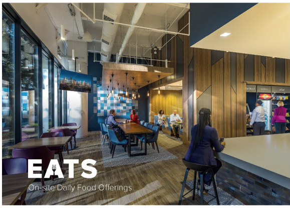
EATS On-site Daily Food Offerings