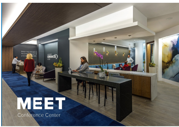
MEET Conference Center