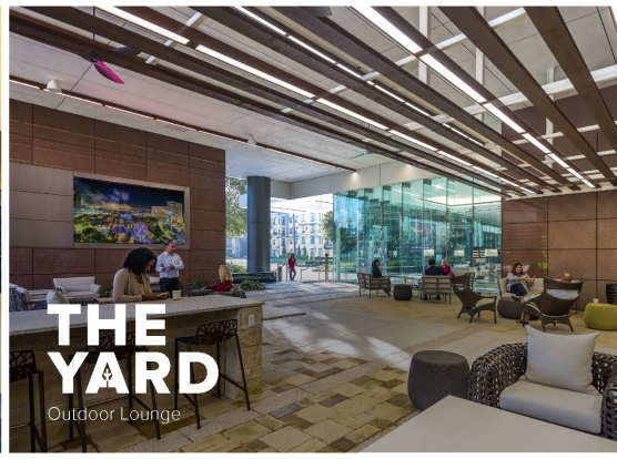
THE YARD Outdoor Lounge