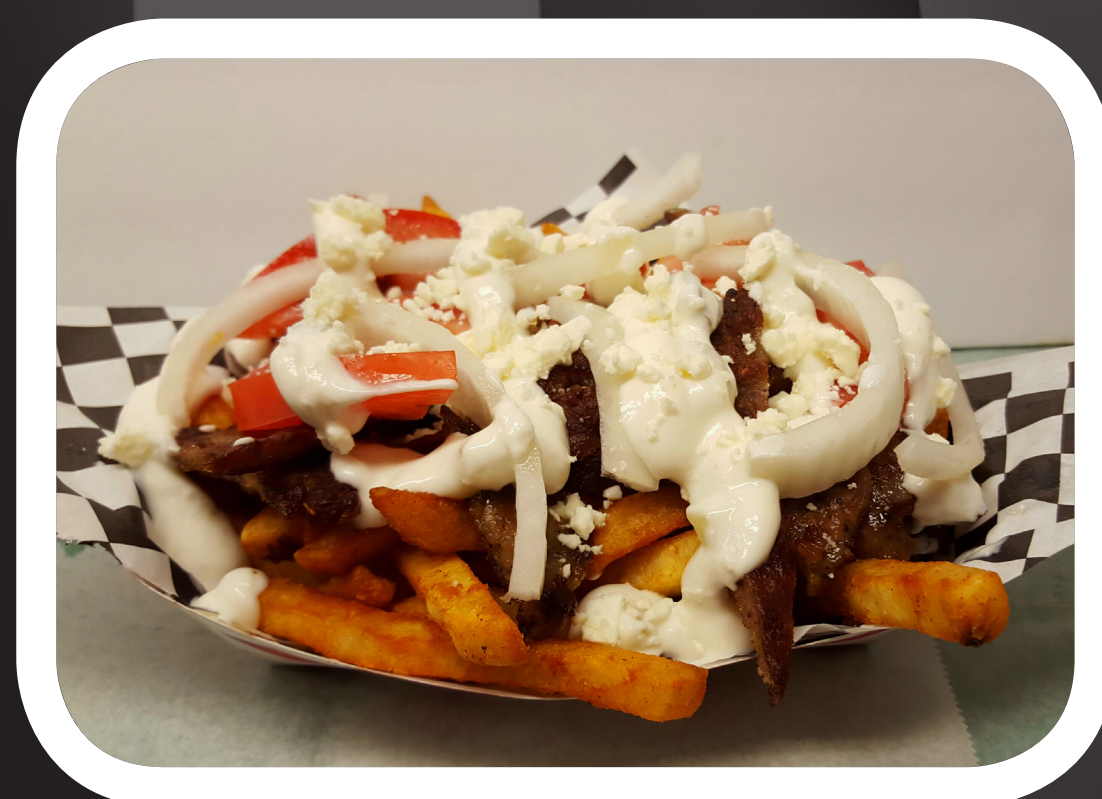
GREEK FRIES $12.5

Wrapped in a Soft Pita Bread • All ingredients shown above