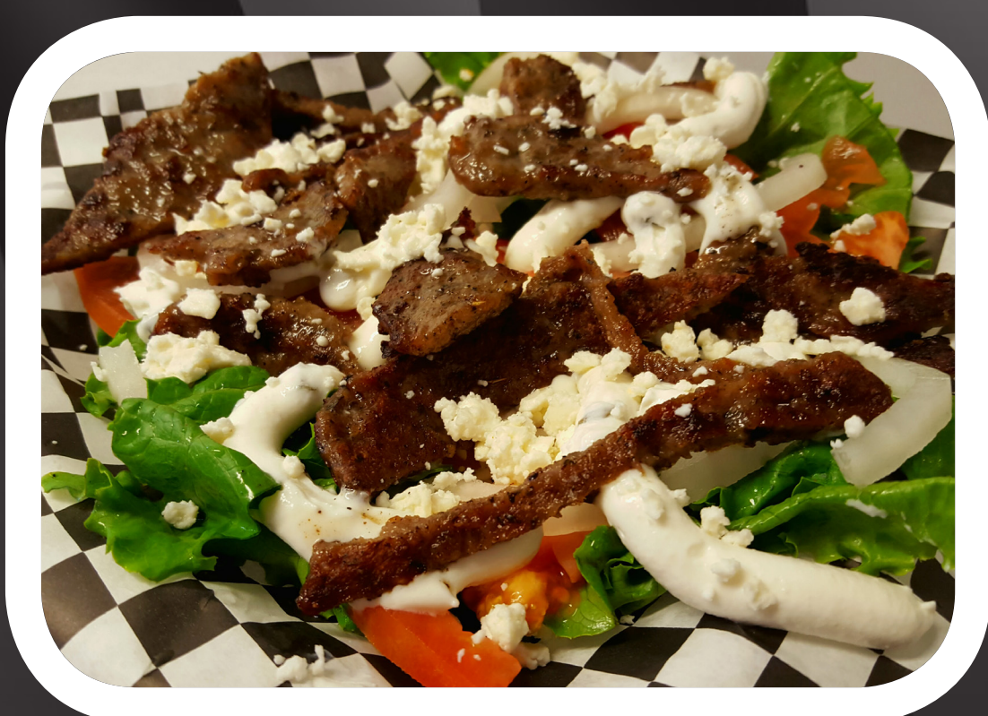
GREEK SALAD $13.5

Melted Queso Served on Seasoned Battered Fries • All ingredients shown above