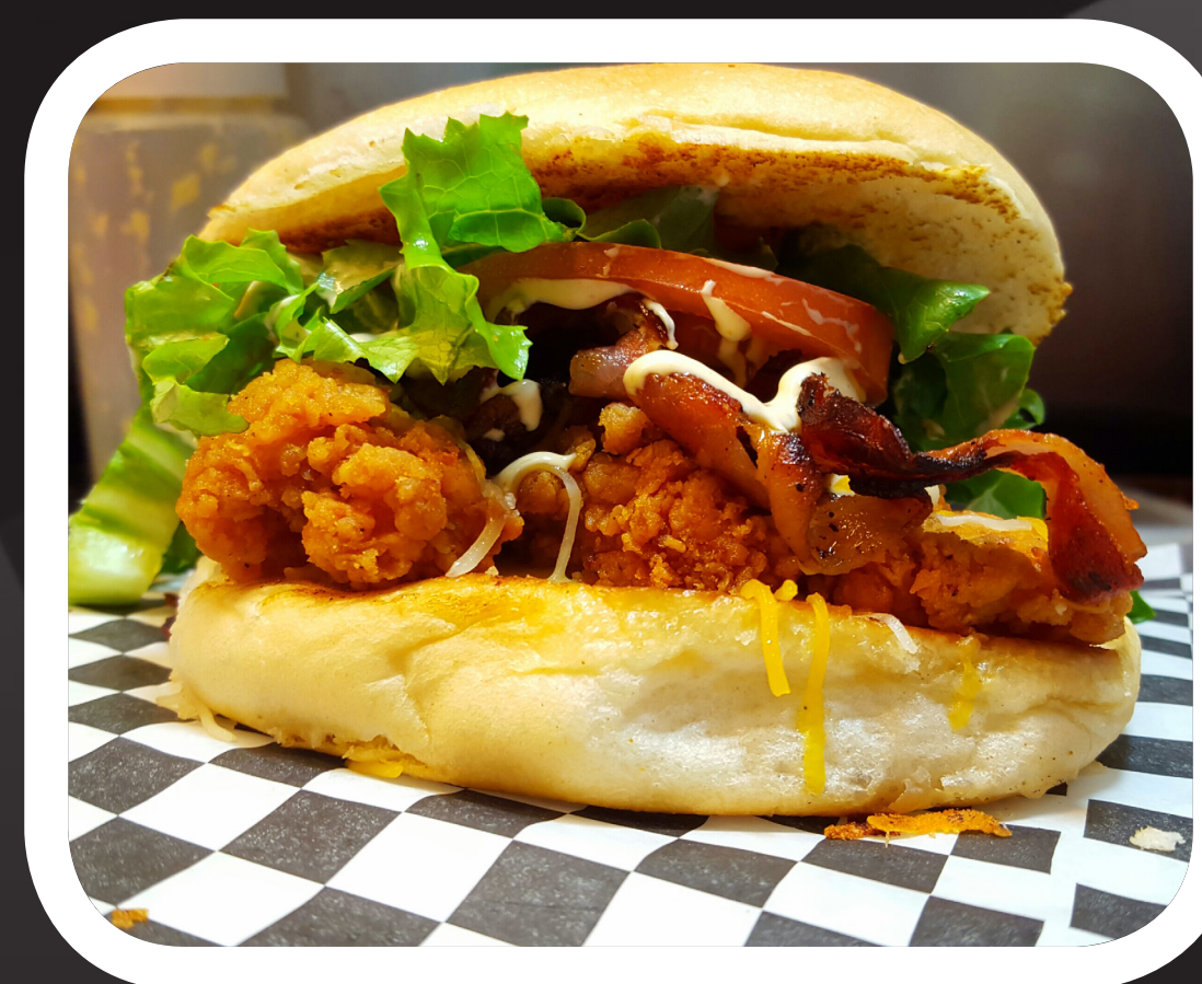
CHICKEN TENDER BACON BURGER

Served on a Toasted Burger Bun with a 1/3 Lbs. Homemade Beef Patty, Crispy Bacon, Cheddar and Monterey Cheese, Grilled Jalapeños, Grilled Onions, topped with Jalapeño Ranch.