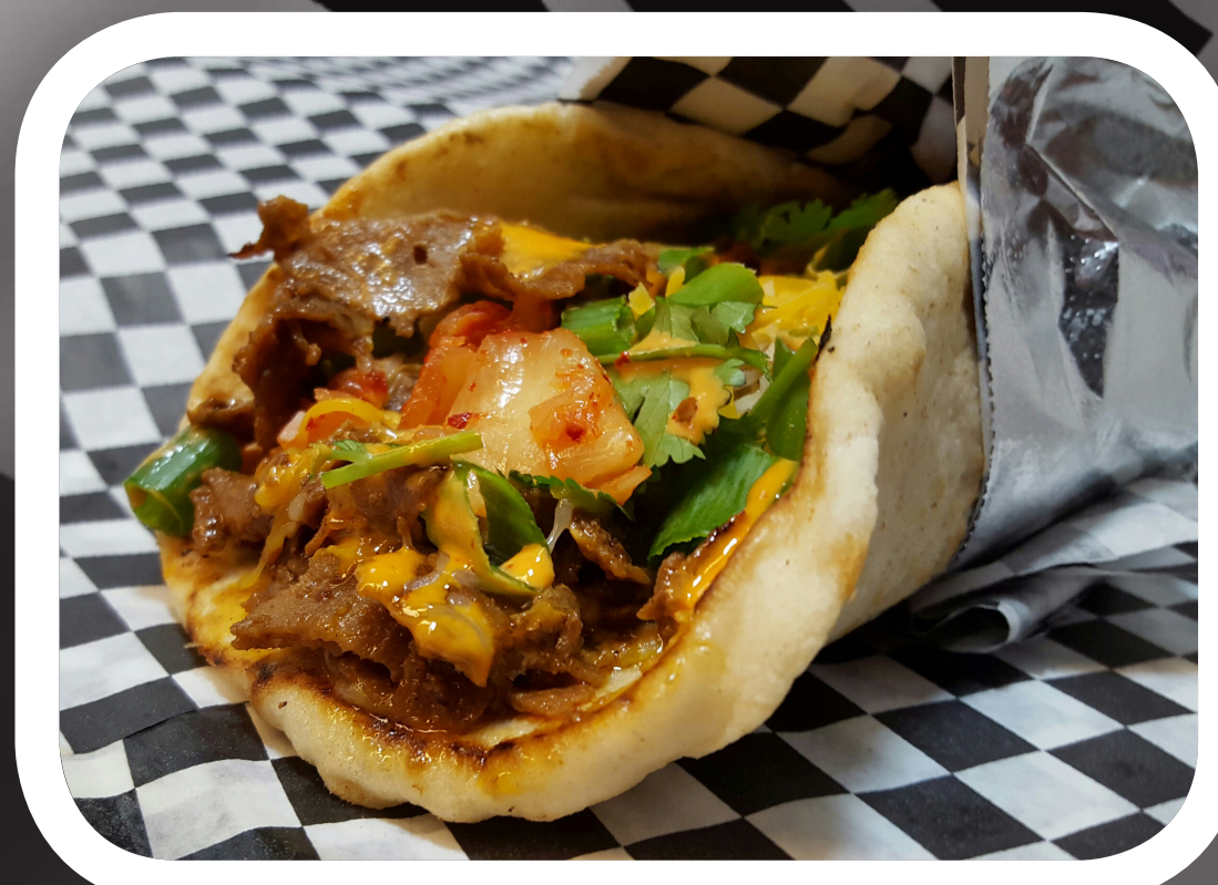
KOREAN PITA $11.5

Served on a Toasted Burger Bun with a 1/3 Lbs Homemade Beef Patty • All ingredients shown above