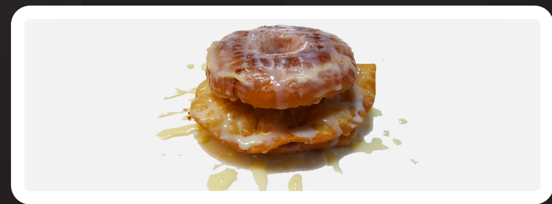
STUFFED DONUT $8

Two Homemade Flour Tortillas Deep Fried to perfection, Glazed with Mexican Caramel (Leche Quemada) or Melted Chocolate, with Sprinkled Cinnamon Sugar.