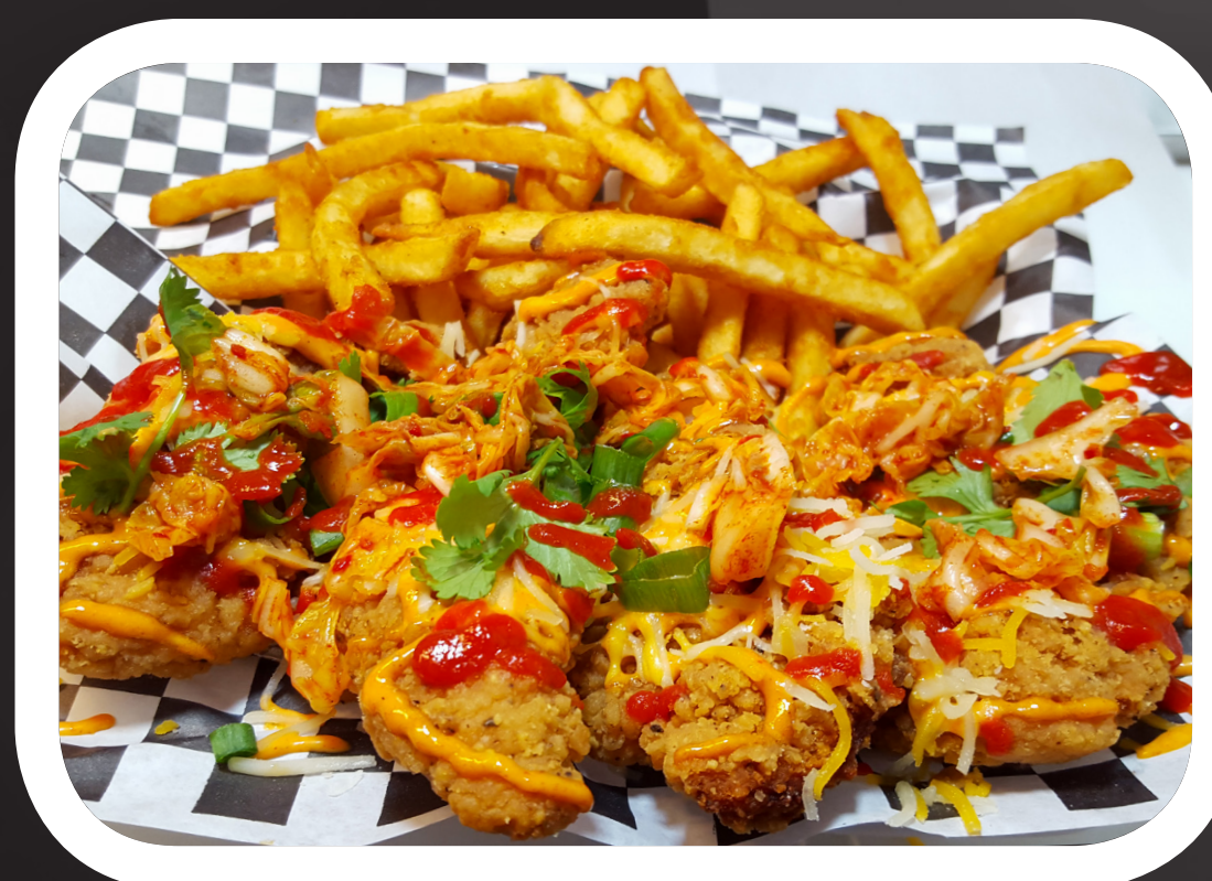
KOREAN SPICY TENDERS $14.5

Served with Seasoned Battered Fries and Melted Queso • All ingredients shown above