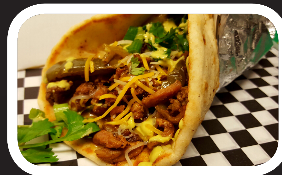
MEXICAN PITA $11

Served with Seasoned Battered Fries and Melted Queso • All ingredients shown above