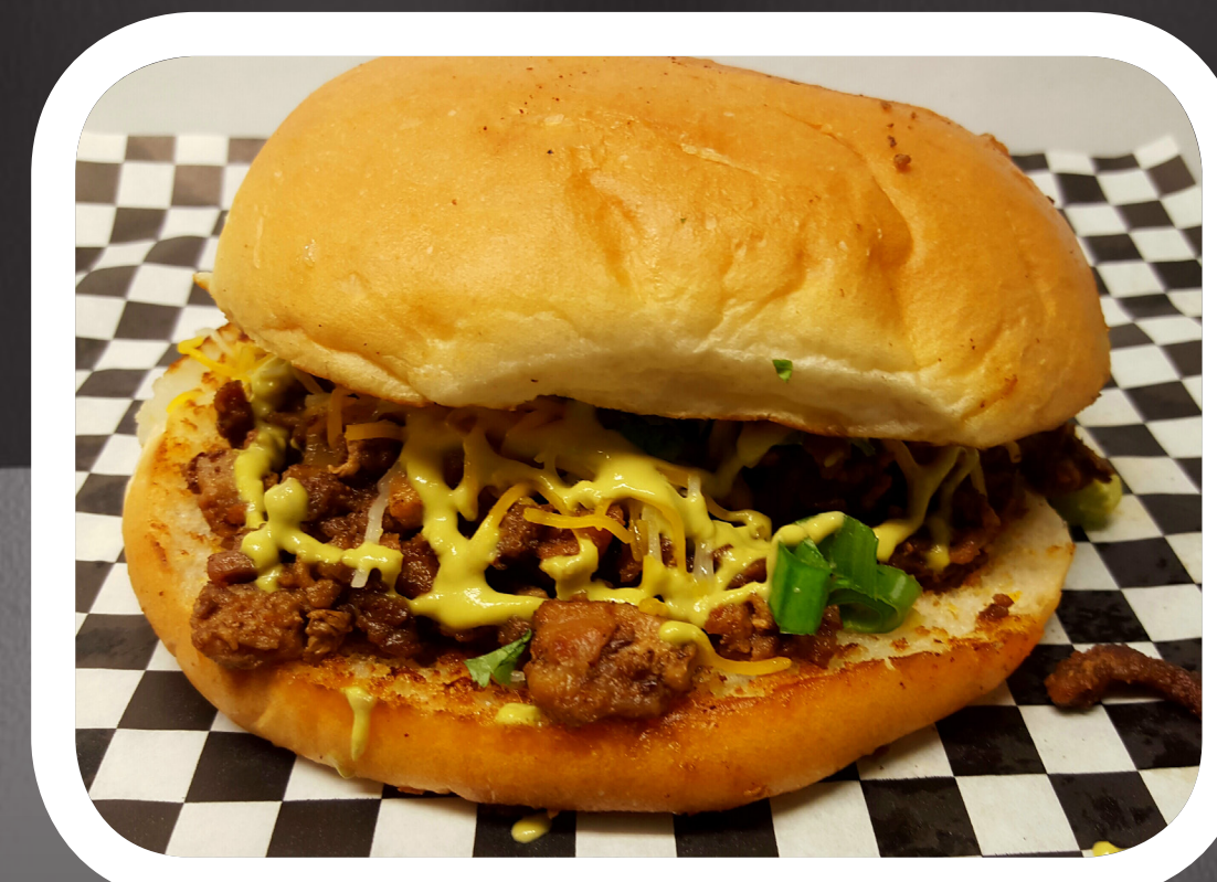
MEXICAN BURGER $13

Fajita Meat • Chopped Spicy Pork • Bacon • Grilled Bell Peppers Grilled Onions • Cheddar and Monterey Cheese • Cilantro Green Onions • Topped with our Spicy Green Salsa