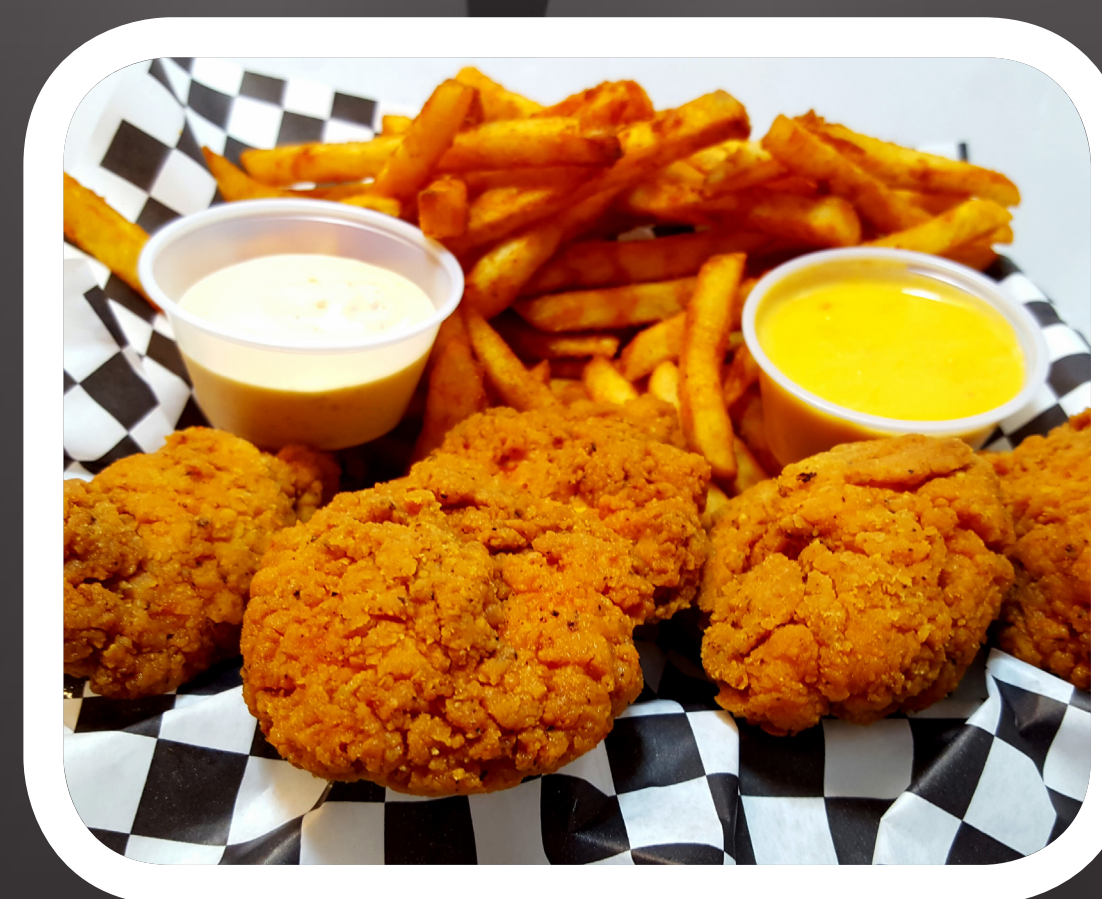
CHICKEN TENDER BASKET $11.5

Served on a Toasted Burger Bun with Chicken Tenders, Mayo, Crispy Bacon, Cheddar and Monterey Cheese, Tomatoes, Lettuce topped with Jalapeño Ranch.