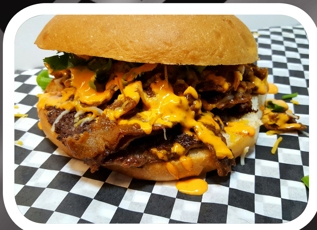
KOREAN BURGER $13.5

Our Famous Korean BBQ Beef • Cheddar and Monterey Cheese Cilantro • Green Onions • Topped with Spicy Kimchi Sauce and Kimchi