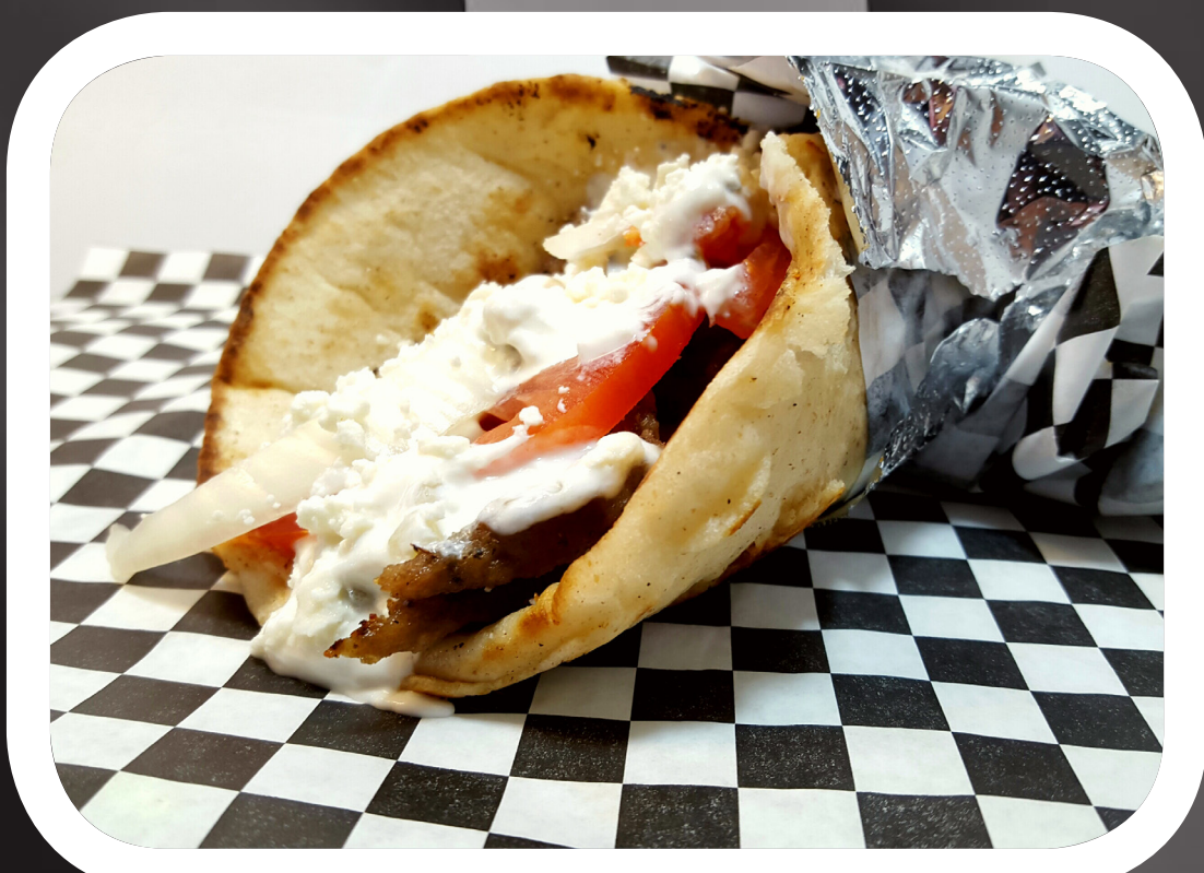
GREEK PITA (GYRO) $11.5

Served on a Toasted Burger Bun with a 1/3 Lbs Homemade Beef Patty • All ingredients shown above