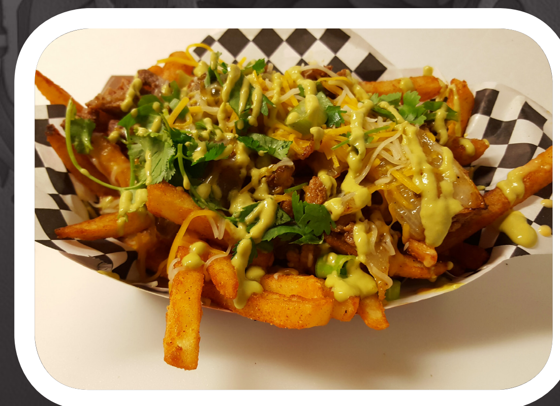
MEXICAN FRIES $12

Served on a Toasted Burger Bun with a 1/3 Lbs Homemade Beef Patty • All ingredients shown above