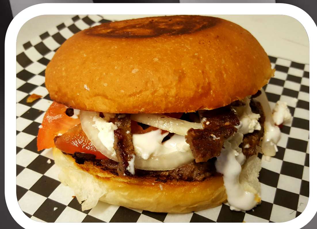
GREEK BURGER $13.5

Gyro Meat (Beef and Lam) • Tomatoes • Onions Tzatziki (Cucumber Yogurt) Sauce • Topped with Feta Cheese