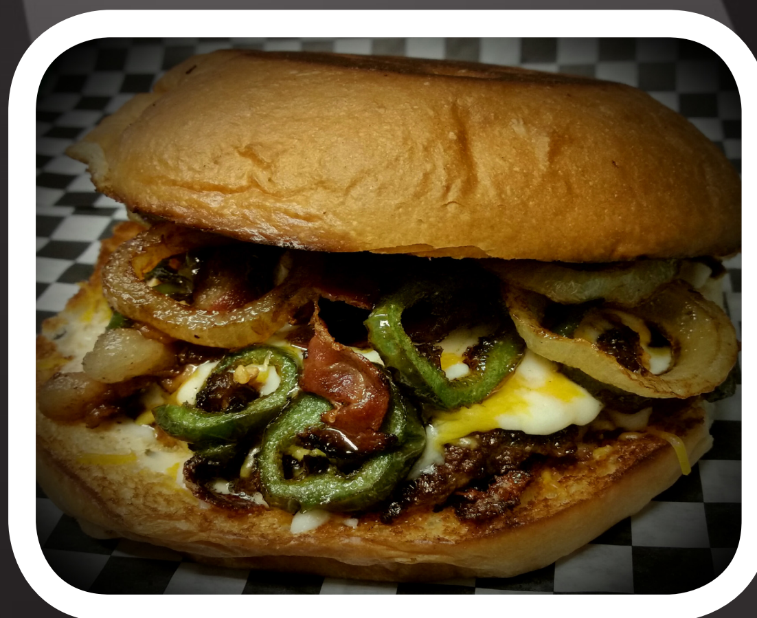
TEXAS POLICY BURGER

Served on a Toasted Burger Bun with a 1/3 Lbs. Homemade Beef Patty, Crispy Bacon, Cheddar and Monterey Cheese, Pickles, Tomatoes, Onions, and Lettuce.